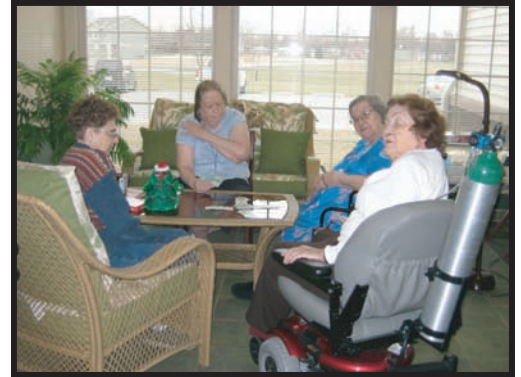
Residents enjoy the updated Sunroom

Please visit us and take a look around . We are so proud of our updates.